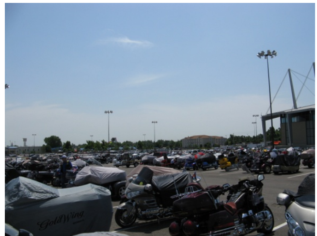
Wing Ding 09 Parking Lot

Lavoie. We traveled quite a bit of the way to Tulsa, Oklahoma on the old Route 66. It was pretty amazing. The weather was perfect with only a small amount of rain in the twelve days we were away. There were approximately 9,500 people in attendance and some great vendors. We even got a chance to sit in one of those Stallions you may have seen advertised in Wing World. This is not my idea of Motorcycle riding, but Stallions are pretty neat. The countryside was beautiful with LOTS of corn fields, and plenty of other views. We arrived in St. Louis, Missouri in the supper hour rush and the traffic was bumper to bumper and the temperature was in the high 90's F., Not very comfortable when we had to sit in traffic for long periods at a time. Next year Wing Ding 32 will be closer to home in Des Moines, Iowa and we hope a lot more people will be able to attend.