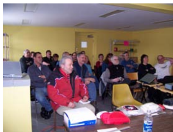
We paid close attention at the Mini Courses.

Thanks to all that came out, our members did a great job in presenting the different courses planned, 19 came plus 8 from Chapter F. Congratulations to Fern Bérubé of Chapter F who won the 50/50 draw of $44.00 and thanks to your patience when we went overtime.