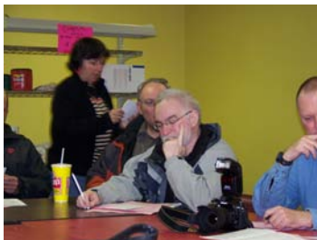
Serious planning is taking place at the Nfld Trip Meeting.